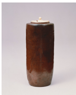
Exhibit No.121 - 128