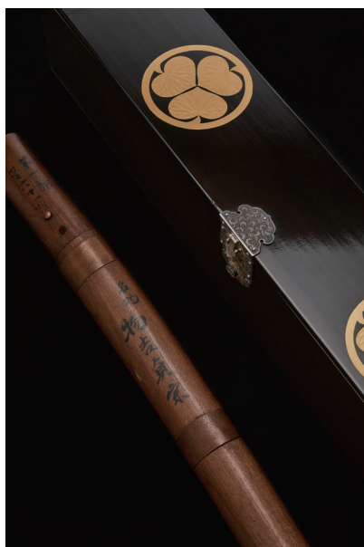
Box and shirasaya plain-wood scabbard for the short sword, Monoyoshi Sadamune

A comprehensive list of all swords ascribed with the status of meibutsu was compiled in the mid-Edo period in a document known as the Kyōhō meibutsu-chō . This catalogue is believed to have been compiled for presentation to the 8th shogun, Tokugawa Yoshimune (1684–1751), by Hon'ami Kōchū, the 13th-generation head of a family of sword polishers and appraisers active since the Muromachi period, based on his family's records. Today, the term meibutsu , in its narrowest sense, refers to the swords appearing in this Kyōhō meibutsu-chō .