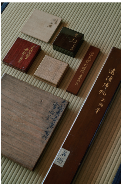
Boxes for various kinds of tea utensils

The first written references to meibutsu tea utensils date from the Muromachi period. In the 16th century, so-called meibutsu-ki (records of famous tea utensils) were compiled, listing objects by type and owner. In the latter half of the 16th century, under the rule of Oda Nobunaga and Toyotomi Hideyoshi, meibutsu tea wares were being collected by merchants from Sakai, Kyoto, and Hakata and meanwhile were also being used by the warrior class in tendering peace negotiations as well as for rewards from lord to vassal, imbuing them with political currency on top of their artistic and commercial value.