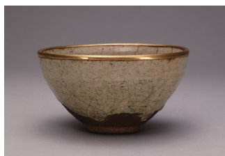
Exhibit No.60 - 90